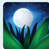
Relax Melodies: Sleep Sounds, White Noise & Fan